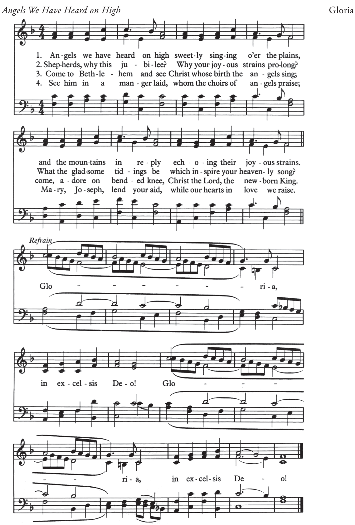
Traditional French Carol