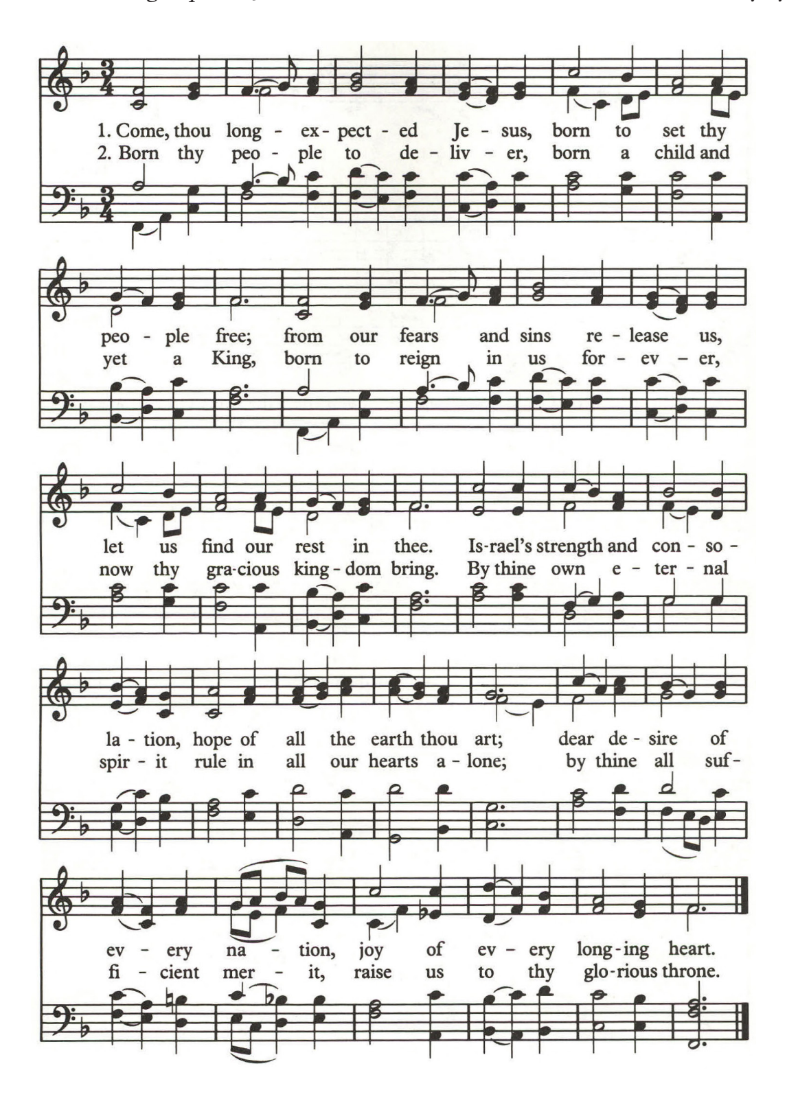
Charles Wesley, 1744